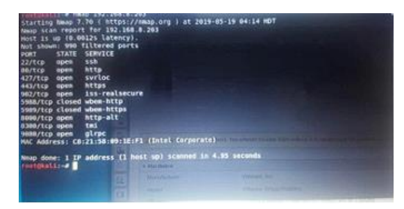
Fig.5: Brute force using Ncrack