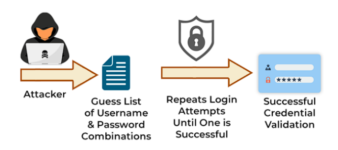
Fig.no:2 (working of brute force attack)

Selecting the target: Attacker will select a specific target to attack such as a user account, website and encrypted files which ever they want to access